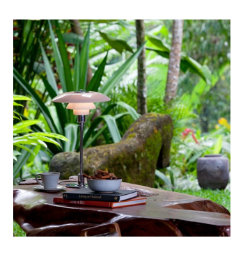
Chapung SeBali Resort & Spa