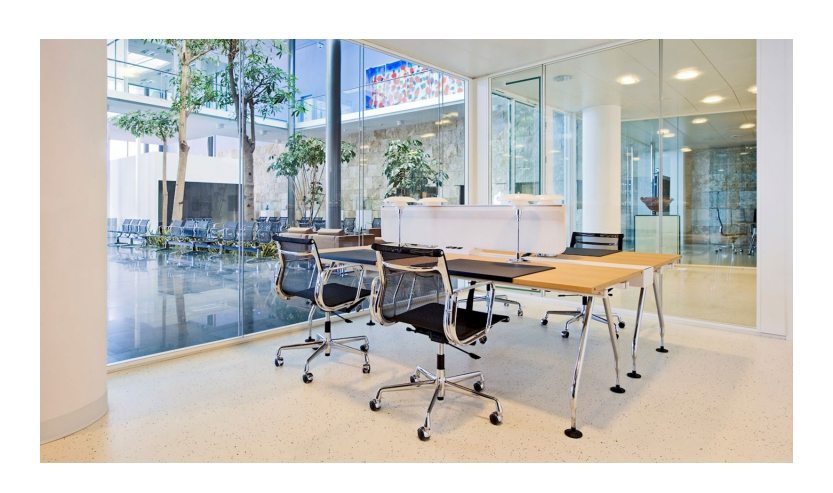
American Heart Institute